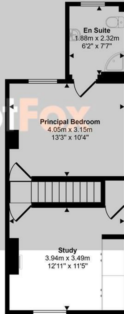
First Floor Approx 35 sq m / 382 sq ft